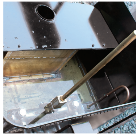
Double ram water pump